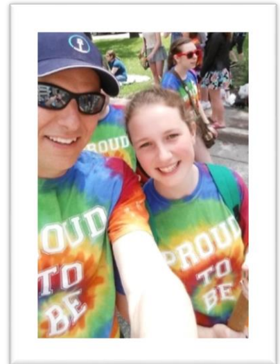
St. Mary's Road United Church, Winnipeg, MB