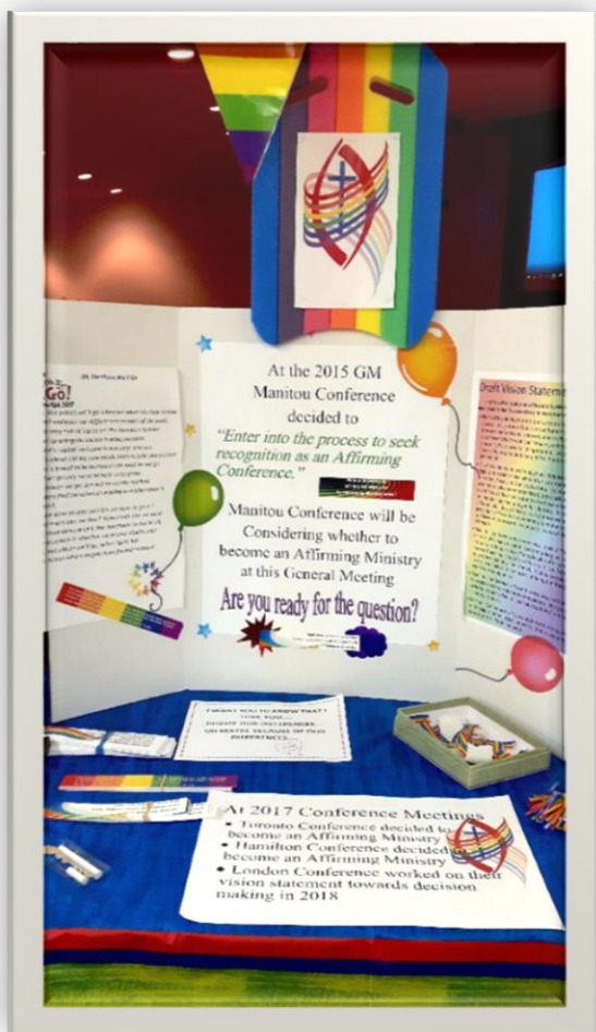
(Photo: Display at Manitou Conference about their Affirming process, which received a positive vote in June 2017.)