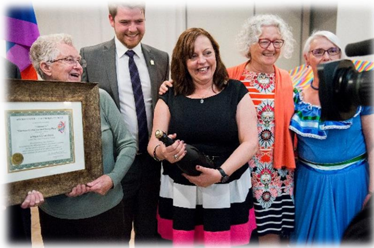
Left: Ashbourne assisted and independent staff and supporters at the celebration, complete with media presence.

North Delta's Crossroads United Church officially recognized as an 'affirming' ministry