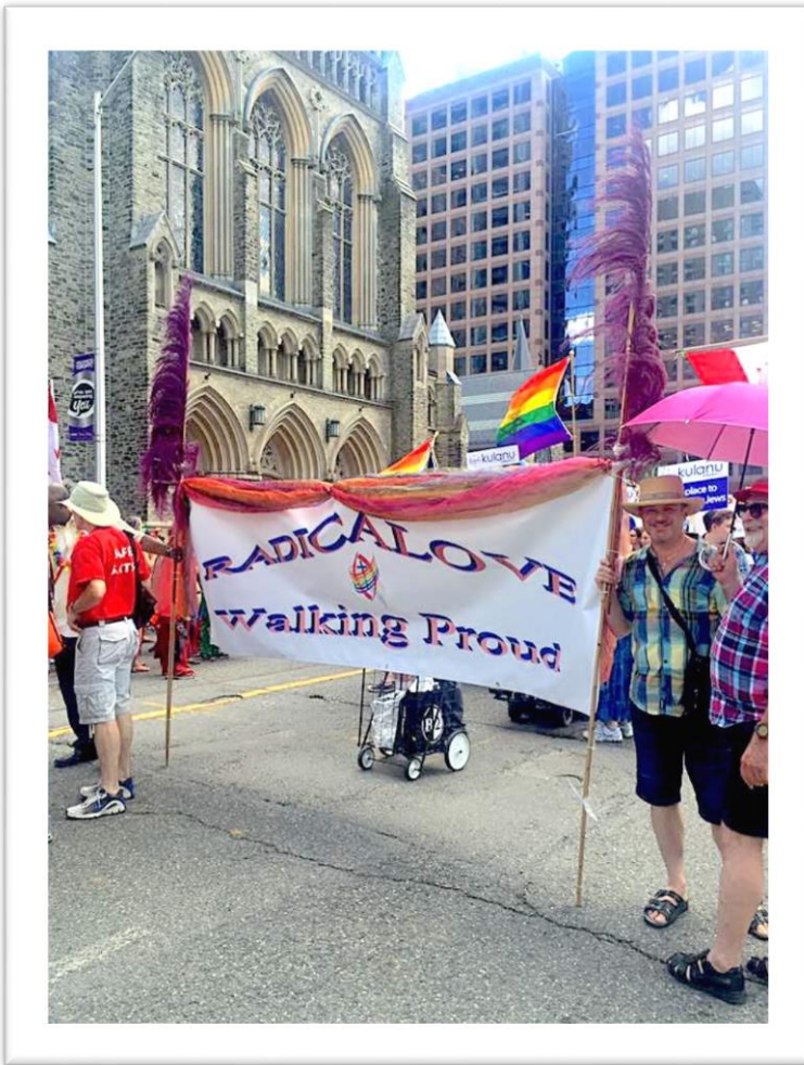
Affirming churches and friends march at the 2016 Toronto Pride parade