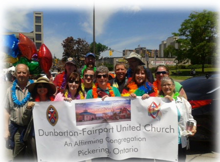
Dunbarton-Fairport United, ON, at Pride 2015.

1-800-268-3781 ext. 4151 jsulliva@united-church.ca