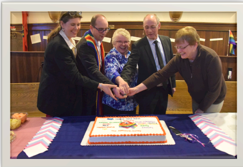
Central United Church, Moncton NB: congregation members and Maritime Conference reps celebrate.

It is a pleasure for us to have the opportunity to work with so many enthusiastic, committed people in the Affirming Ministry Program. We are grateful and our hearts are warmed when we hear the many stories of amazing Affirming journeys.